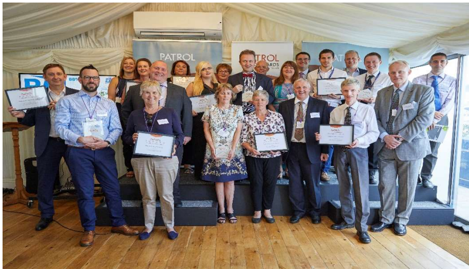
The PARC awards Shortlisted Councils at the House of Commons reception 2019

PATROL has appointed Cheshire East Council to perform the role of Host Authority. The expectation is that services provided to PATROL will replicate the arrangement with an arm's length body, with the Host Authority providing services and advice as required and underpinned by a service level agreement.